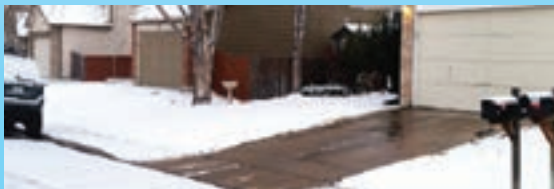
Deicer will not allow Snow & Ice to build up